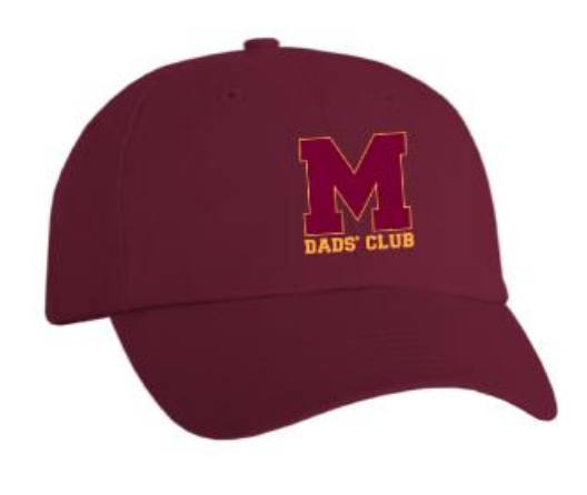
Mercy Dad's Club Unstructured Cap