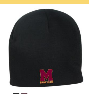
Mercy Dad's Club Knit Beanie $10.00