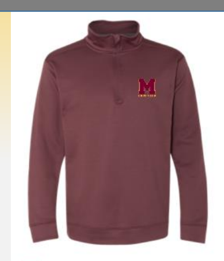
Mercy Dad's Club Quarter-Zip Pullover Sweatshirt