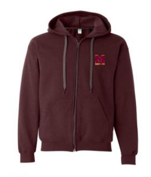
Mercy Dad's Club Full-Zip Hooded Sweatshirt