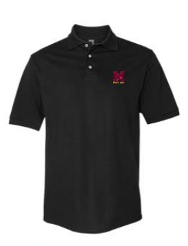
Mercy Dad's Club Polo $20.00