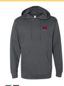
Mercy Dad's Club Midweight Hooded Sweatshirt $25.00