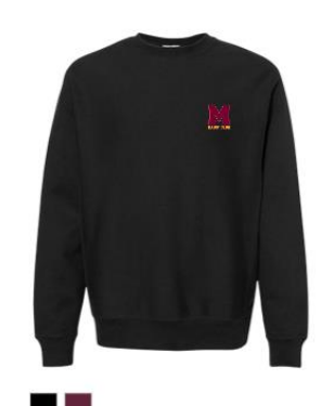
Mercy Dad's Club Premium Heavyweight Sweatshirt