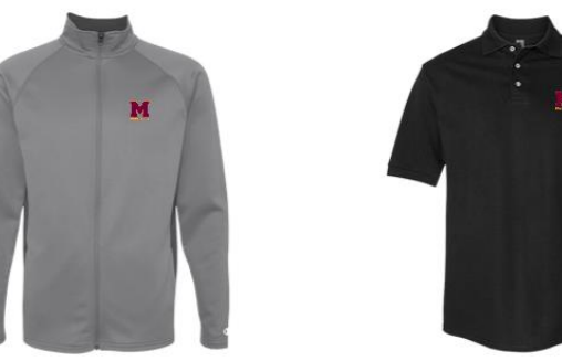
Mercy Dad's Club Performance Full-Zip Jacket