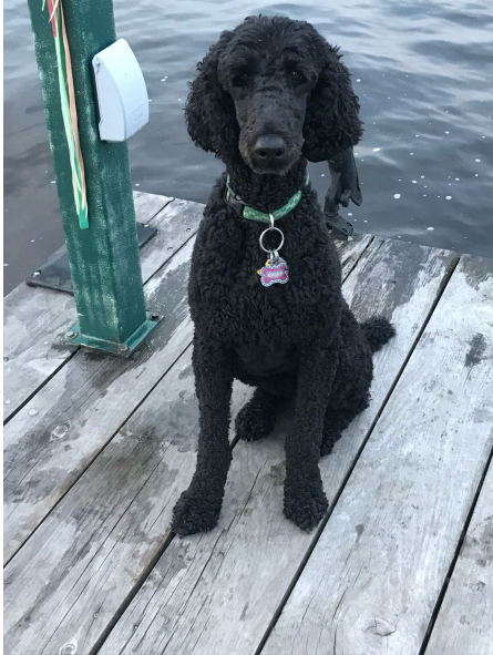
Kelby, 11 Standard Poodle