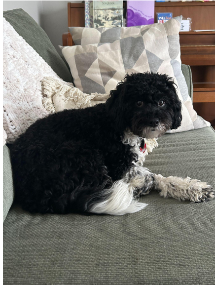
Finnick 7 mo

Years at Mercy: 8 (17 years at an all-boys schools)