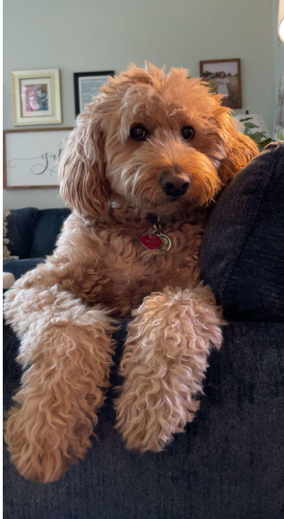
Dublin 11 y/o Goldendoodle