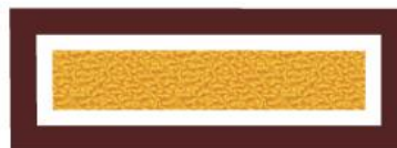
ALL-DISTRICT Gold-White-Lt Maroon