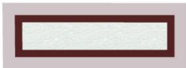
ALL-ACADEMIC White-Lt Maroon-Grey