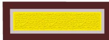
ALL-COUNTY Lemon-Grey-Lt Maroon