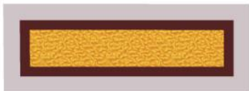
ALL-CATHOLIC Gold-Lt Maroon-Grey