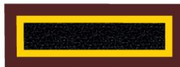
ALL-AREA Black-Gold-Lt Maroon