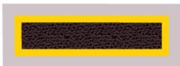
ALL-LEAGUE Light Maroon-Gold-Grey