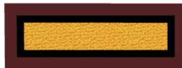
ALL-REGIONAL Gold-Black-Lt Maroon