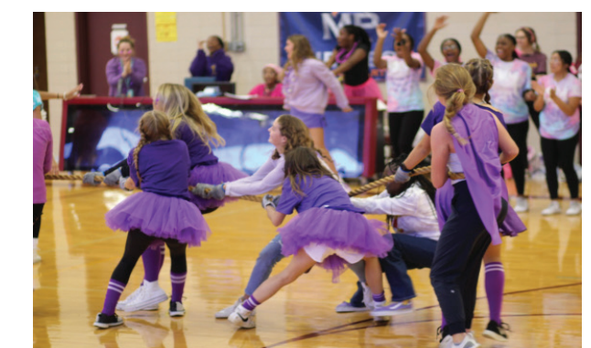
Sophomores dressed in class color purple competing at 2022 Field day. Tug of war battle breaks out between 9th and 10th graders.

As the thoughts for this week are combined from