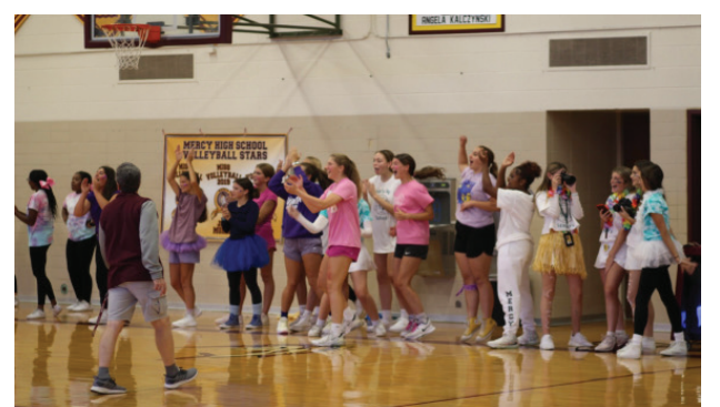
Students cheering for staff .vs. student basketball game. Spirit week 2022 holds lots of excitement at Field day

"The committees are comprised of all grade levels," Richter said. "We also do a personality test to see where they fall. I like to vary the groups based on that as well, in efforts to get all types of voices and personalities reaching out to one another's ideas."