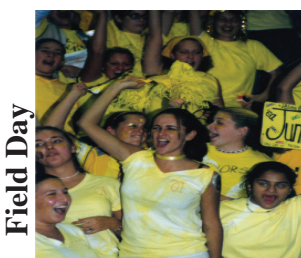
Field Day One aspect of Spirit Week is that grades support and cheer each other on during competition.