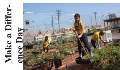
Make a Difference Day

One important aspect of Spirit Week is when every student goes to different organizations to do service. This day, known as Make a Difference Day, brings together the Mercy community to serve those in need.