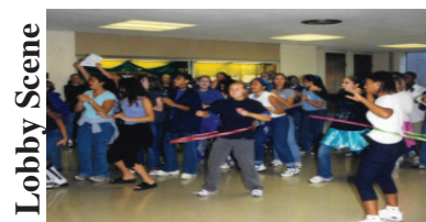
Lobby Scene In the past, Mercy students would act out skits based on the spirit week themes. Students could walk through the lobby and see the scene being acted out.

Spirit Week takes place on September 18-22 and concludes with the Homecoming dance on September 24.