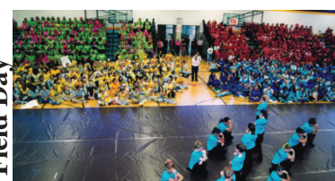
Field Day At Mercy, it is tradition for the different grades to have class colors. Pictured here is the whole school in their colors for Field Day.