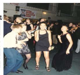
Homecoming Mercy students celebrate the end of spirit week with the Homecoming dance. Here they are shown dancing the night away with friends.

One important aspect of Spirit Week is when every student goes to different organizations to do service. This day, known as Make a Difference Day, brings together the Mercy community to serve those in need.