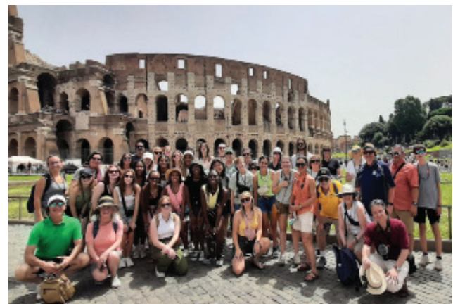
Mercy students, staff members, and family all visit the Colosseum in Rome, Italy. The Latin trip took place from June 18-July 1, 2023.

All of these experiences reiterate reasons why you should always stay aware and prepared. So, as you travel in the coming years, remember the importance of having a plan to remain safe and if you ever feel unsafe, speak up.